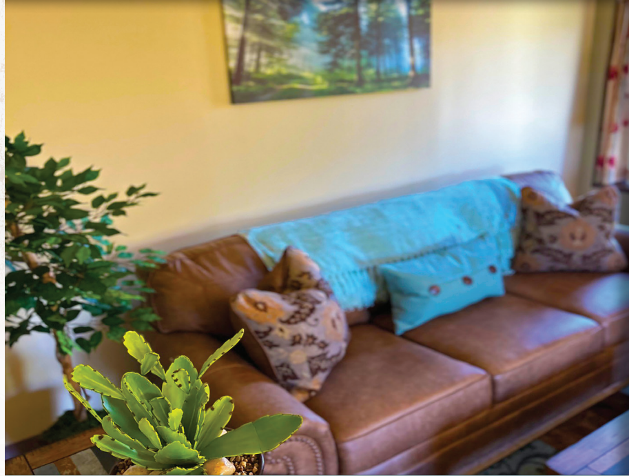
This hospice suite, in an area skilled nursing facility, provides privacy and comfort to hospice families.